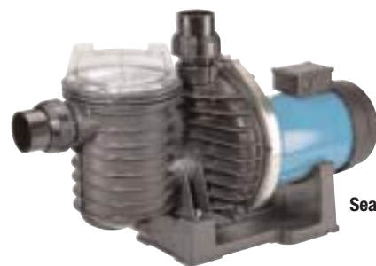
Sea Bass 22

The Sea Bass range of pumps will reduce costs in your organisation through long life, minimising replacement costs, and high efficiency, minimising operating costs.